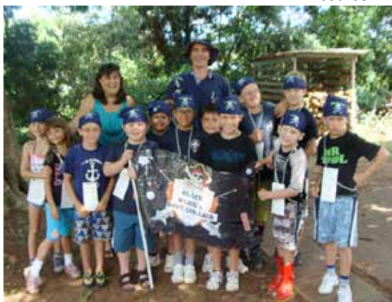
57th Trafalgar Pirates